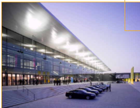
International Conference Centre Stuttgart