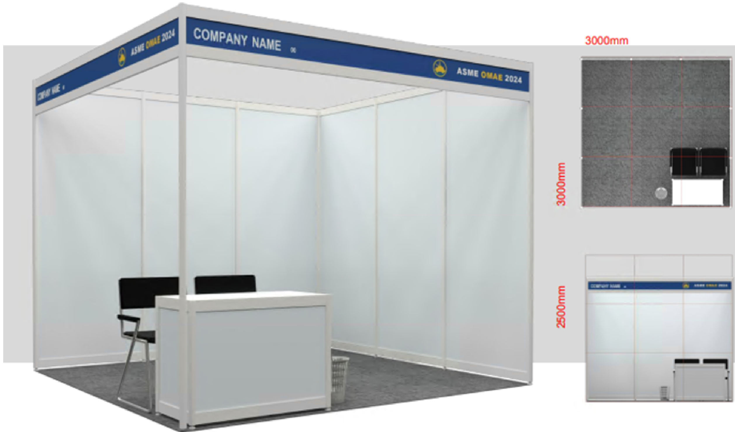
Exhibit Booth Cost: 4,500 SGD

Booths are 9sqm - shell scheme two with two sides open.